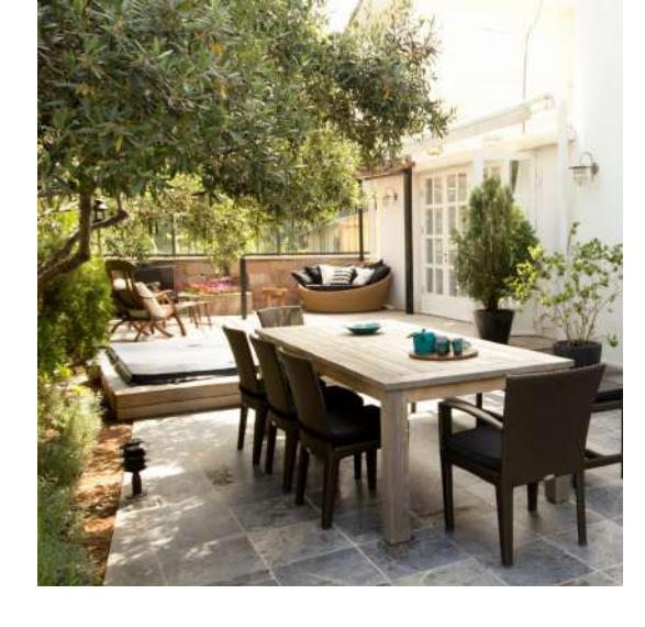
20 Updates That Will Increase the Value of Your Home

Planning on selling your home soon? Do you know it probably needs a few updates to sell for what you want? Here are 20 cheap home updates that will help! CHEAP meaning the more affordable option over a major project or renovation!