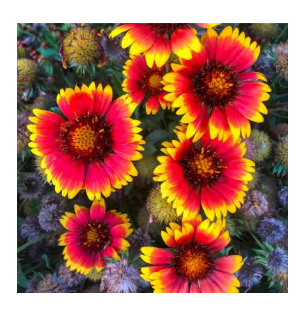
31 Studding Drought Tolerant Flowers You Need for Your Garden

Hot weather can be difficult for plants to survive in, but various drought-tolerant plants can even thrive in these conditions. From cacti and succulents to herbs and ornamental grasses, a wide range of options are available for gardeners who want to cultivate green spaces despite the heat.