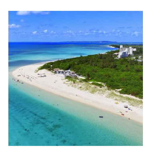
Japan's Best: Top 5 Luxury Escapes

Japan, a land of timeless tradition and futuristic innovation, offers some of the world's most luxurious retreats. From tranquil hot springs to vibrant urban centers, these top-tier destinations promise unparalleled experiences for discerning travelers. Here's a closer look at the top 5 luxury escapes in Japan.