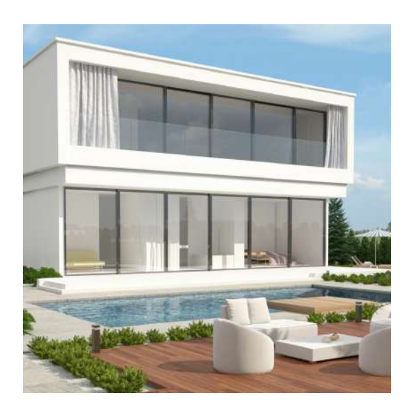
What You Need to Know Before Buying a Luxury Home

Is now a good time to buy a luxury home? A recent run-up in luxury home values, coupled with higher mortgage rates, has some wondering if they should stay on the sidelines, at least for a while. Our view: Don't be excessively cautious. We see good value across the U.S. market, in part because the dynamics of the luxury housing market have changed in ways that are not always well understood.