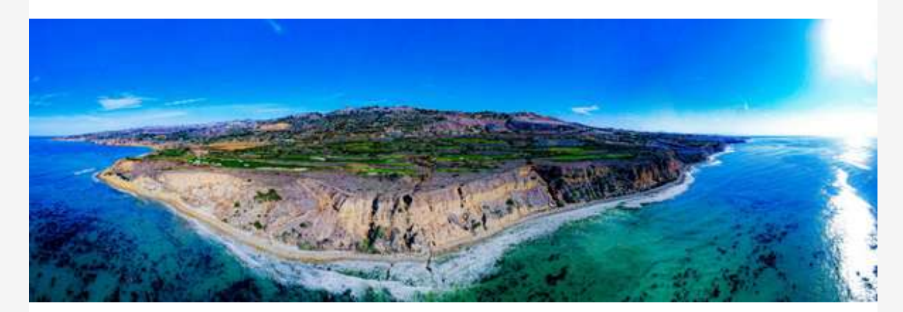
June 2024 Newsletter

China on Track to Lose 15,000 Millionaires in 2024: Report | China in Focus